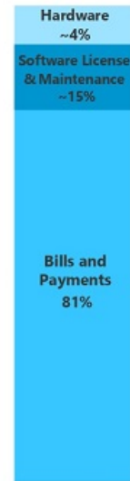
Services & Products